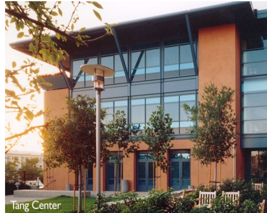
The Tang Center is at 2222 Bancroft Way.