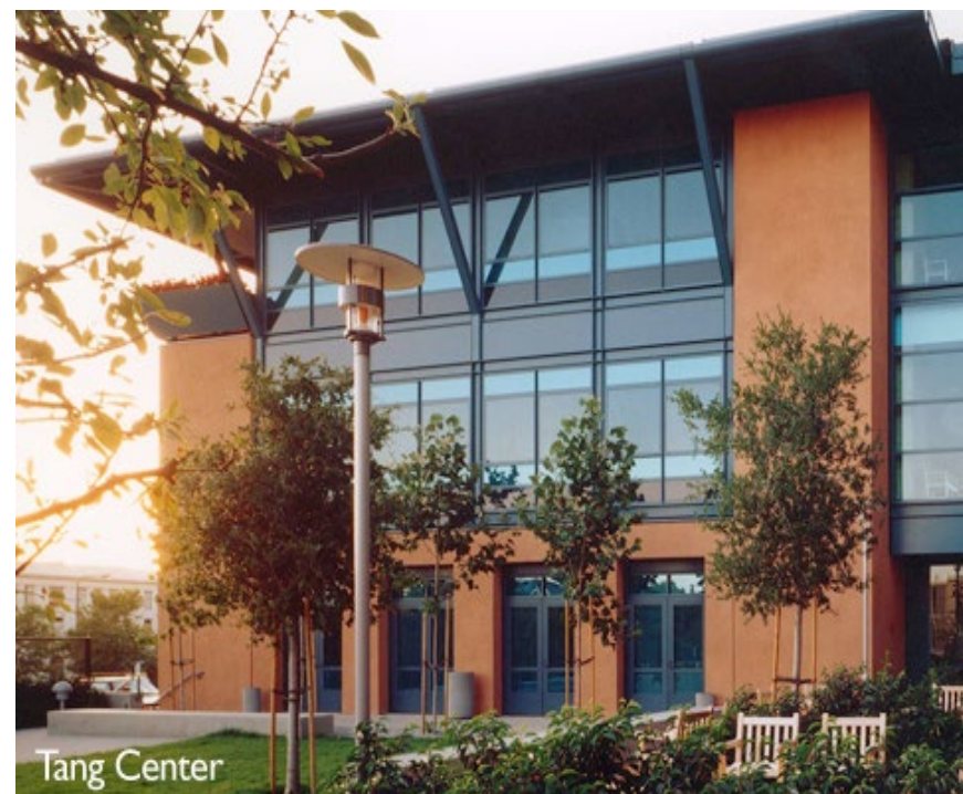
The Tang Center is at 2222 Bancroft Way.