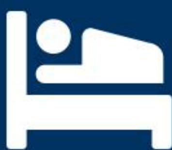
Bed sheets & Blanket