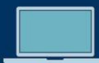
Electronics (laptop/ phone)